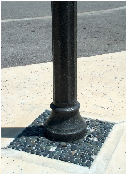
VICTORIAN II BLACK