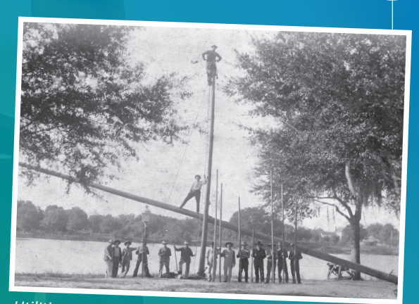
Utilities workers place Orlando's first electric pole that would serve as the foundation for the birth of OUC.

Throughout our rich history, OUC has remained committed to being a leader in the safe and reliable delivery of electricity and water, while always striving to do so responsibly and sustainably. This ambition led to several milestones, such as generating power from landfill gas and solar farms, to designing Reliable Plaza to meet LEED Gold Certification, to vehicle electrification, to using ozone treatment to improve water quality and many more.