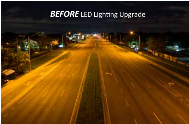
BEFORE LED Lighting Upgrade

LED Streetlight Upgrade OUC & NFL Green Energy Community Garden Energy Conservation Home Repair Service - PCN Bacchus Bash