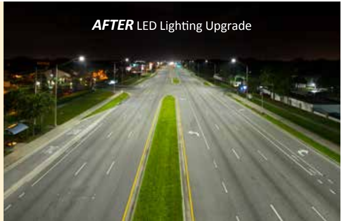
AFTER LED Lighting Upgrade