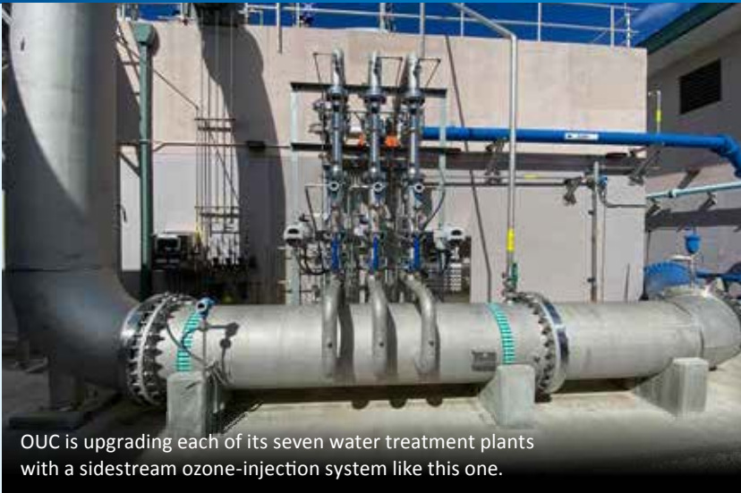
OUC is upgrading each of its seven water treatment plants with a sidestream ozone-injection system like this one.

OUC is investing in new water treatment technologies that will reduce the amount of energy needed to produce clean, tasty water. The sidestream ozone-injection system is a pipeline through which untreated well water flows as bubbles of ozone are injected into it. The process