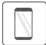
Plugged-In Mobile Devices

Protect yourself against unexpected expenses from damaging power surges. Call 1-877-320-4616 and enroll in the Surge Protection Plan* from American Water Resources of Florida. It's affordable financial protection for your household budget.