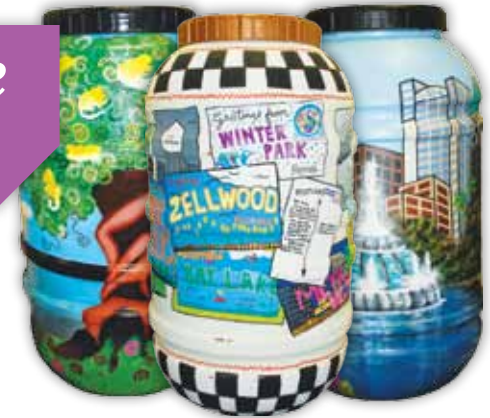
Rain barrels painted by middle school students to promote water conservation